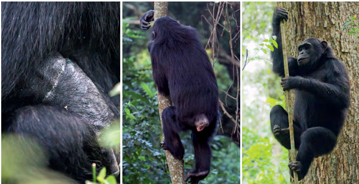
Special two months after intervention (left and middle) and gripping a branch three months after intervention (right).