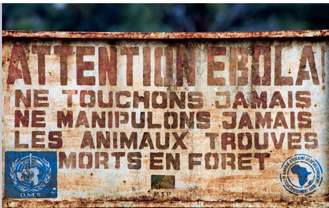
Photo: Is it justifiable to spend significant resources on a potentially unachievable goal of protecting apes against Ebola virus disease (or another threat to their health) in situ while the health needs of neighboring human communities remain unmet due to a lack of funds?

60 mountain gorillas ( Gorilla beringei beringei ) to protect them against what they presumed was measles, although the diagnosis remained unconfirmed (Cranfield and Minnis, 2007).