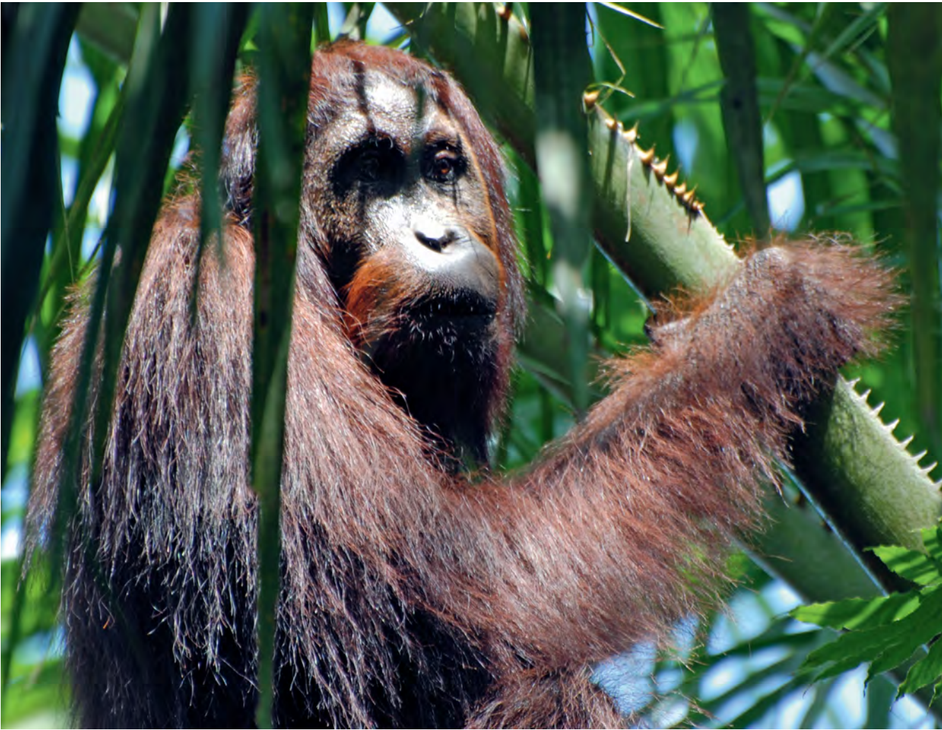
Photo: When species conservation goals conflict with the interests of human individuals and collectives, they can generate difficult moral dilemmas whose resolution requires careful consideration and respect. Orangutan in an oil palm plantation.

of interspecies interdependence, attuned to the flourishing of both humans and animals as members of their ecological communities (Batavia et al. , 2021; Kirby, Steindl and Doty, 2017; Nieuwland, 2020).