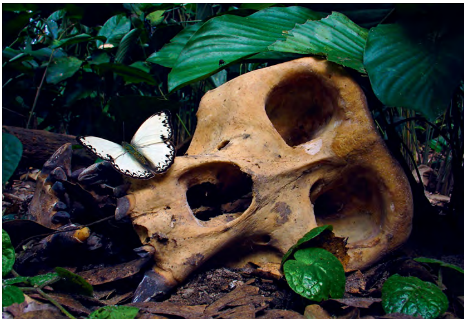
Photo: Some conservation policies implicitly treat individual animals as irrelevant or expendable, while some frame them only in terms of their contribution to the species overall or to other conservation goals. Skull of a western lowland gorilla.

There are many ways to include animals in ethical decision-making. One way is to consider who or what matters morally, and