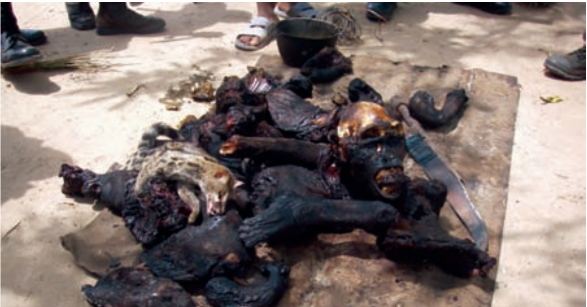
Photo: Cooked and smoked bushmeat for sale, including ape meat, at a market in the Central African Republic.

country study (Villegas et al. , 2012). It represents a serious and growing threat to biodiversity due to extraction methods and as a result of large numbers of miners in areas of high biodiversity. Artisanal miners have also been described as being amongst the poorest and most marginalized members of society. This chapter integrates the extent of artisanal mining activity within previously identified ape habitats and presents detail on mitigation strategies currently in existence. In the context of conservation, economic activity, and human rights, it illustrates the negative environmental impacts of uncontrolled ASM, which encompass direct impacts such as habitat destruction, and indirect impacts such as water pollution and increased hunting pressure. As ASM further encroaches into critical ape habitats, approaches that include policy and legislative development, coupled with poverty alleviation measures, are likely to have the greatest impacts. However, little has been achieved in this direction as ASM continues to remain poorly understood and regulated, further exacerbated by inadequate and corrupt governance structures.