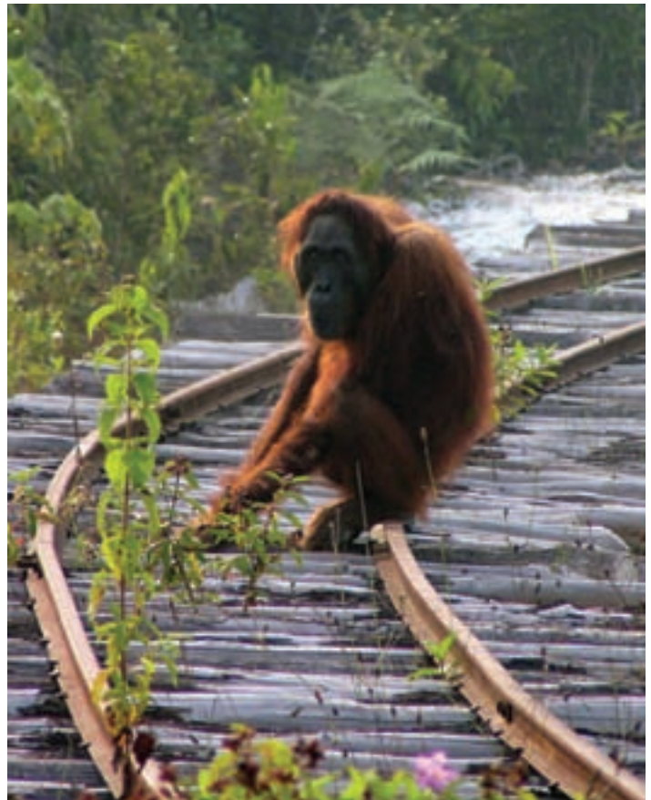
Photo: Great ape and gibbon habitats are increasingly interfacing with extractive industries . . . a lone orangutan.

Section 2 presents two chapters that focus on the status of apes in situ (Chapter 9) and in captivity (Chapter 10). Chapter 10 concludes by highlighting some of the linkages between captive apes and extractive industry.